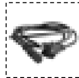
Power Cord *